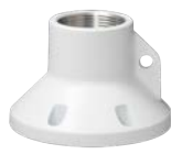
WV-QCLI01-W Mount Bracket