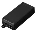
WJ-PU201/G PoE Injector